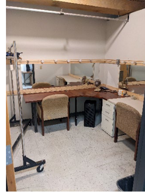
Dressing Room 4 – accommodates 2