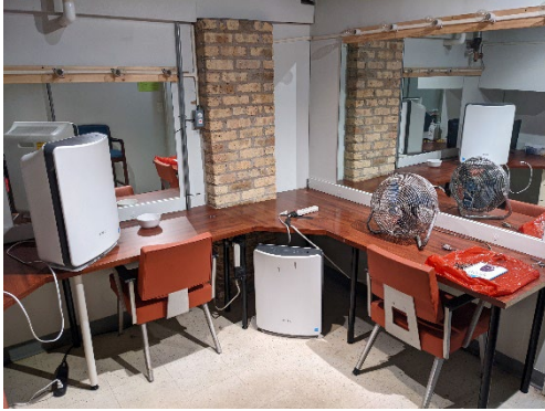
Dressing Room 1 – accommodates 2-3

The Cabot Theatre has 4 available dressing rooms: